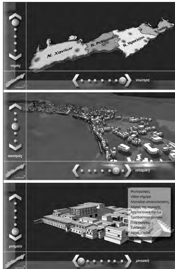
Figure 2. Three modes of the application's interface.