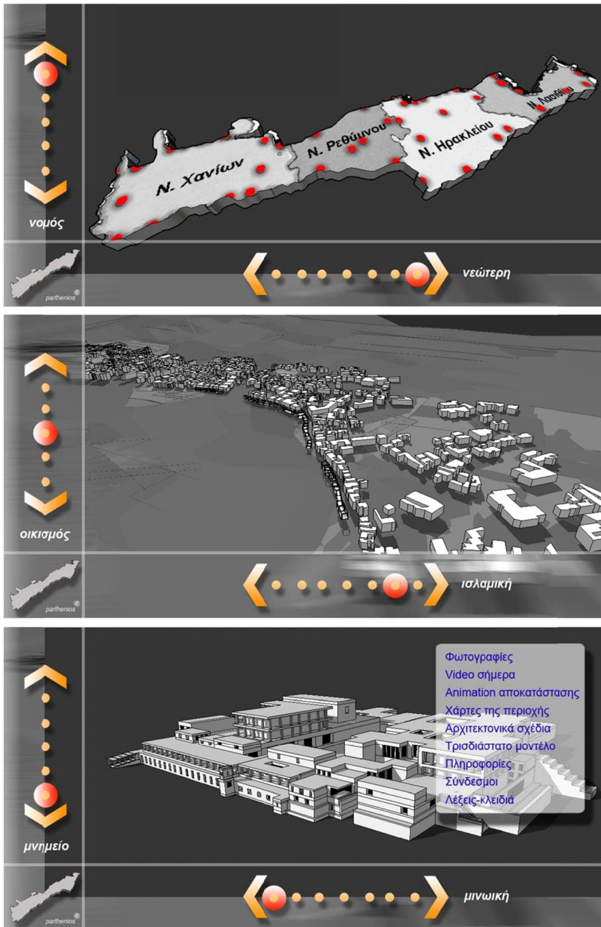
Figure 2: three modes of the application's interface