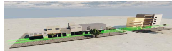
Figure 2. Translation of 1866 Square at Chania (Greece) to music